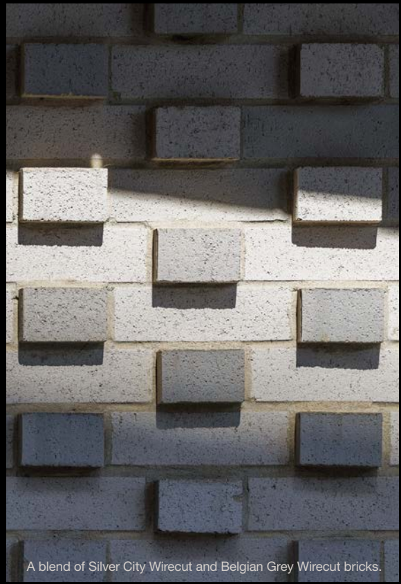
A blend of Silver City Wirecut and Belgian Grey Wirecut bricks.